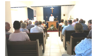
St. Luke's Prodromi