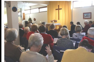
St. Stephen's Tala