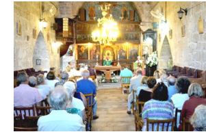
Ayia Kyriaki Kato Paphos