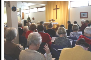
St. Stephen's Tala