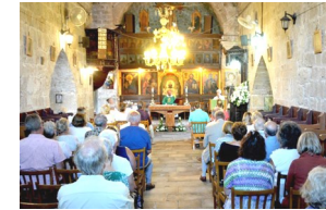
Ayia Kyriaki Kato Paphos