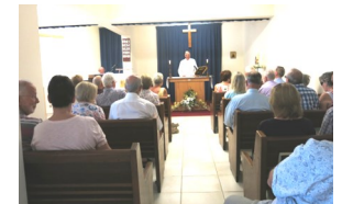
St. Luke's Prodromi