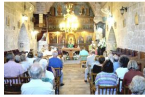
Ayia Kyriaki Kato Paphos