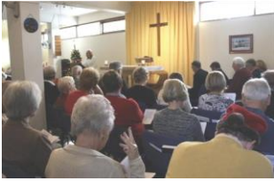
St. Stephen's Tala