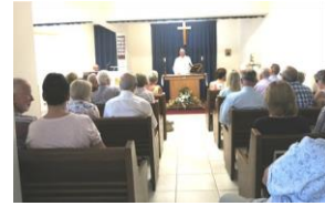
St. Luke's Prodromi