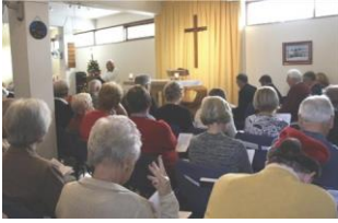
St Stephen's Tala