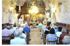
Ayia Kyriaki Kato Paphos